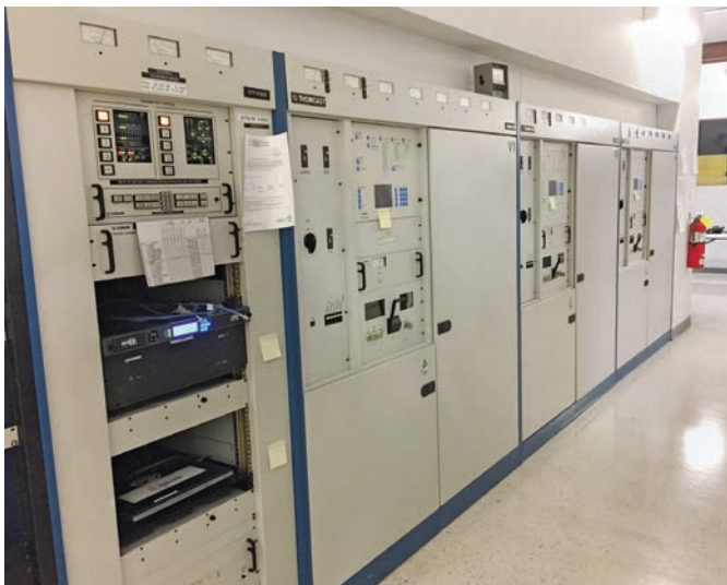
The ATSC 3.0 Cleveland, Ohio test station transmitter.

With the 2009 digital transition still fairly fresh within the collective minds of the broadcast industry, transitioning yet again to another incompatible modulation standard seems counter-productive at best. However, since 2009, the population has gone mobile with amazing ferocity—if you don’t carry a cell phone in your pocket, you risk becoming forgotten.