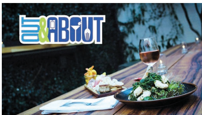
Screen shot from WRAL's regularly scheduled 4K "Out & About" broadcast.

coding rate, from QPSK to 4096-QAM. These ModCods allow a broadcaster to trade off bit rate for robustness.