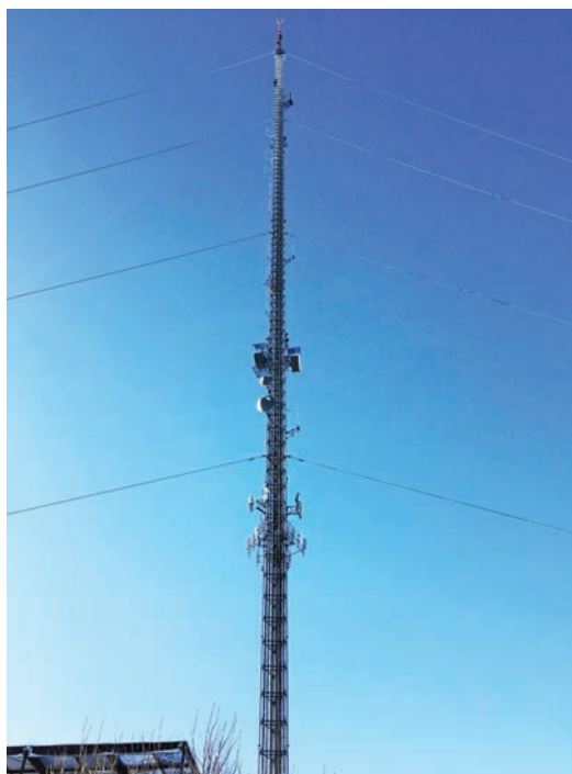
The tower for the test station in Cleveland, Ohio. The ATSC 3.0 station’s antenna is side-mounted at about two-thirds of the way up the tower.

“NAB is very grateful to the FCC for rapidly approving authorization of the next generation television standard and adopting rules for U.S. television stations offering ATSC 3.0 services on a voluntary basis,”