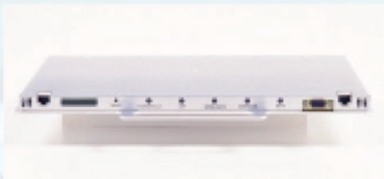
Serial Modulation Encoder Module