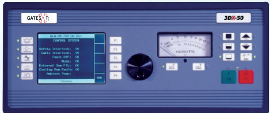
3DX-50 Control Panel

If you operate Medium Wave transmitters, your future destiny should be DX Destiny!