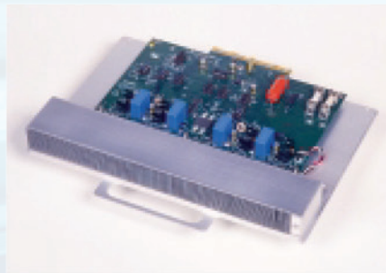
RF Power Amplifier

The 50 kW DX Destiny uses four plug-in serial modulation encoders. Each encoder provides the direct drive to 16 RF power amplifier modules, which are turned ON or OFF to produce the modulated RF signal. All serial modulation encoders are the exact same module and, with the auto-servicing feature, the transmitter can still operate with less than four active encoders.