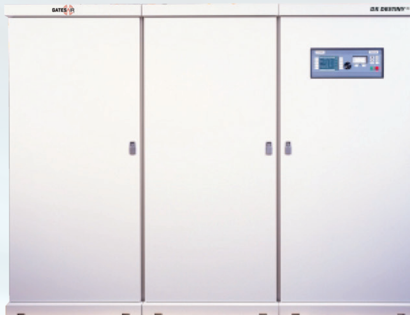
Power Supply Cabinet