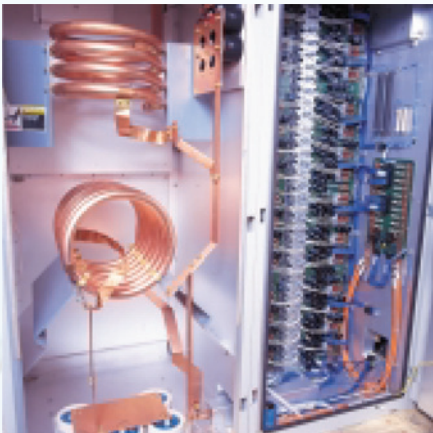
Output Network (left), RF Combiner (right)

Output from RF power amplifiers is summed in a simple, field-proven combiner. The combiner assembly is readily accessible from the rear of the transmitter and redesigned for easier servicing. This allows individual RF motherboards to be easily removed.