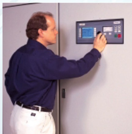
The 3DX-50 is easy to operate.

The DX Destiny is designed for easy use through the IntelliStat™, the ultimate in control and diagnostic user interfaces. This combination of large, internationally-identified control buttons, a status panel with selectable metering, and 1/4 VGA display provides all important control and status parameters needed to know exactly how the transmitter is performing.