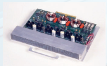
Binary RF Amplifier

The 50 kW DX Destiny uses 62 main and six binary solid-state RF power amplifiers. These modules protect themselves from over-temperature, loss of RF drive, loss of power and shorted RF output conditions, and are hot-pluggable for on-air servicing. These modules are of simple construction with easy access to the individual MOSFET transistors.