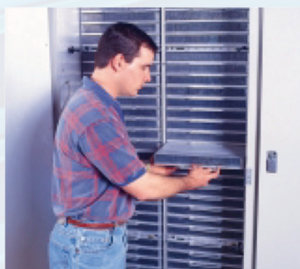
RF modules may be removed while on the air