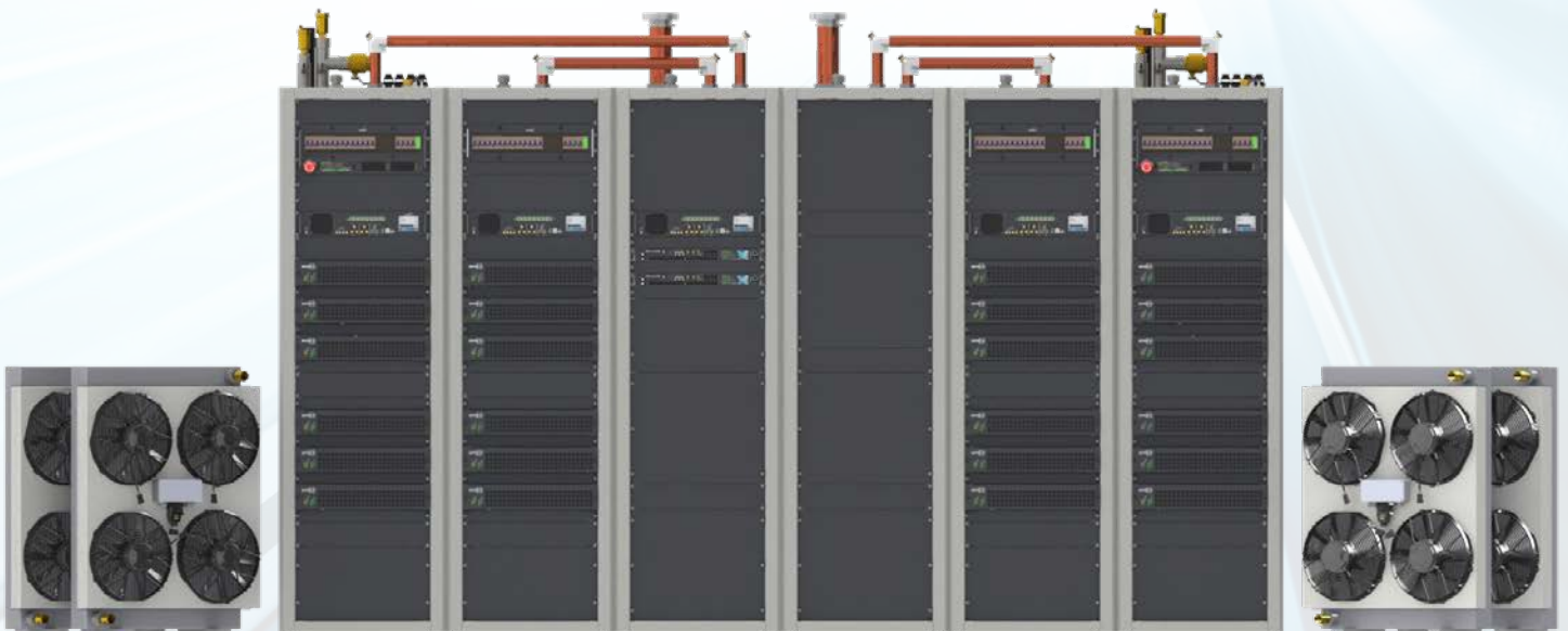
Maxiva™ ULX-OP-A-24P8E-R42 Liquid-Cooled 84kW Analog Transmitter System