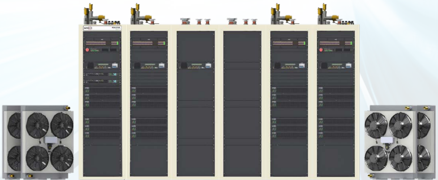
Maxiva™ VLXTE-OP Liquid-Cooled DTV Transmitter System