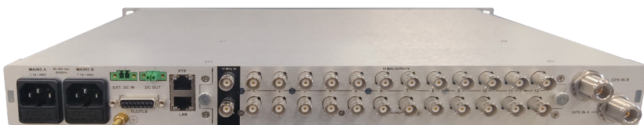
GNSS-PTP back panel