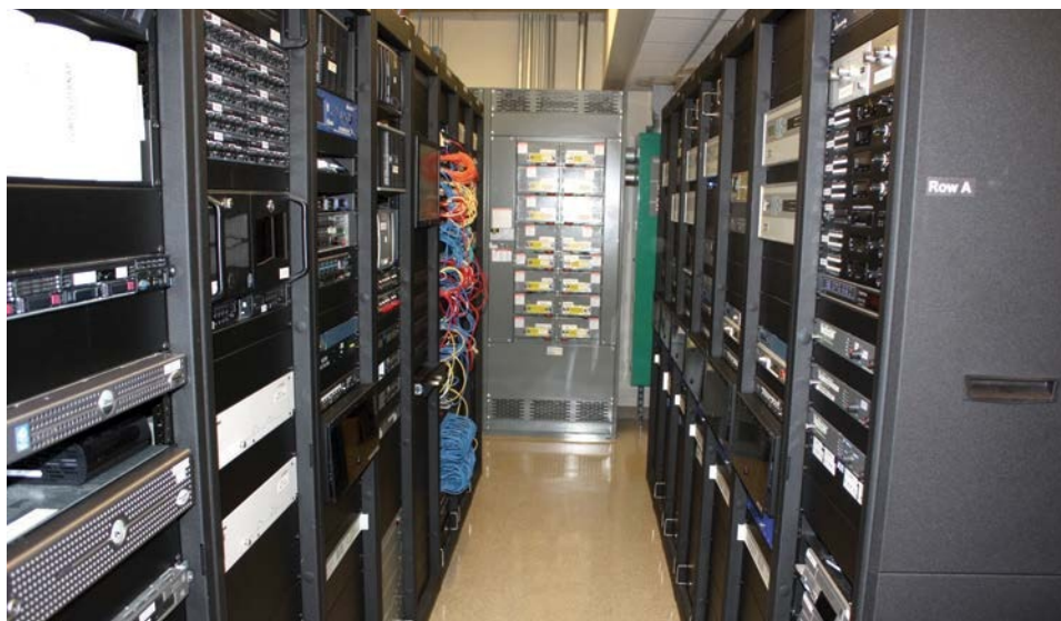
Main TOC racks: Right racks are for each station with all switching, processing, EAS and STL gear. Left racks hosts support gear (file servers, phone systems, aircheckers, networking and satellite gear).

Soundproofing was addressed by doubling the sheetrock between individual studios and installing diffusing and selective frequency-absorbing panels in each control room to bring the isolation and internal sound management required to conduct multiple live programs with studios in close proximity.