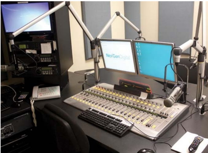
Fox Sports WCWA, flagship station for the world famous Toledo Mud Hens minor league baseball team (GatesAir 24 channel Airwave console).

routing system, the GatesAir VistaMax with 96x96 analog, 96x96 digital and 32 logic ins/outs is in use.