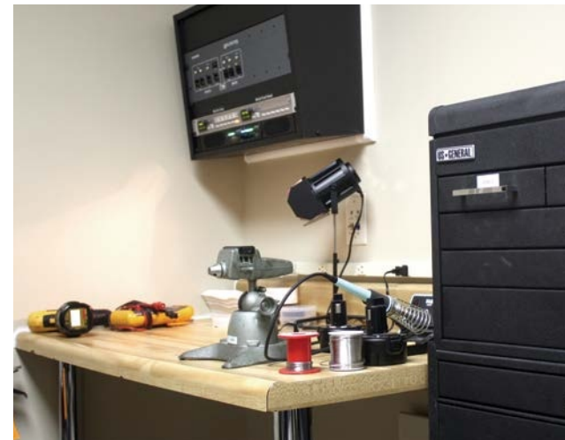
Main workbench area, with access to the VistaMax router.