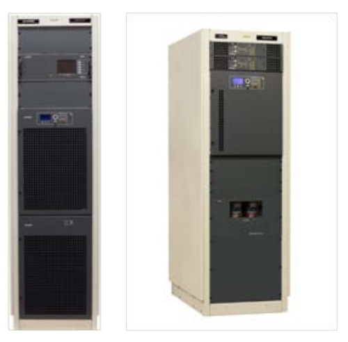
Figure 3 – New High Efficiency FM and TV Transmitters

For TV transmission, two new products, the Maxiva VAX (Band III VHF) and the Maxiva ULXT (UHF), both with PowerSmart<sup>®</sup> 3D technology have been recently introduced.